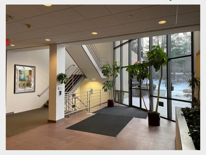
Trefoil Park Properties (TPP) can leverage decades of experience to customize top-quality dynamic office space at attractive pricing